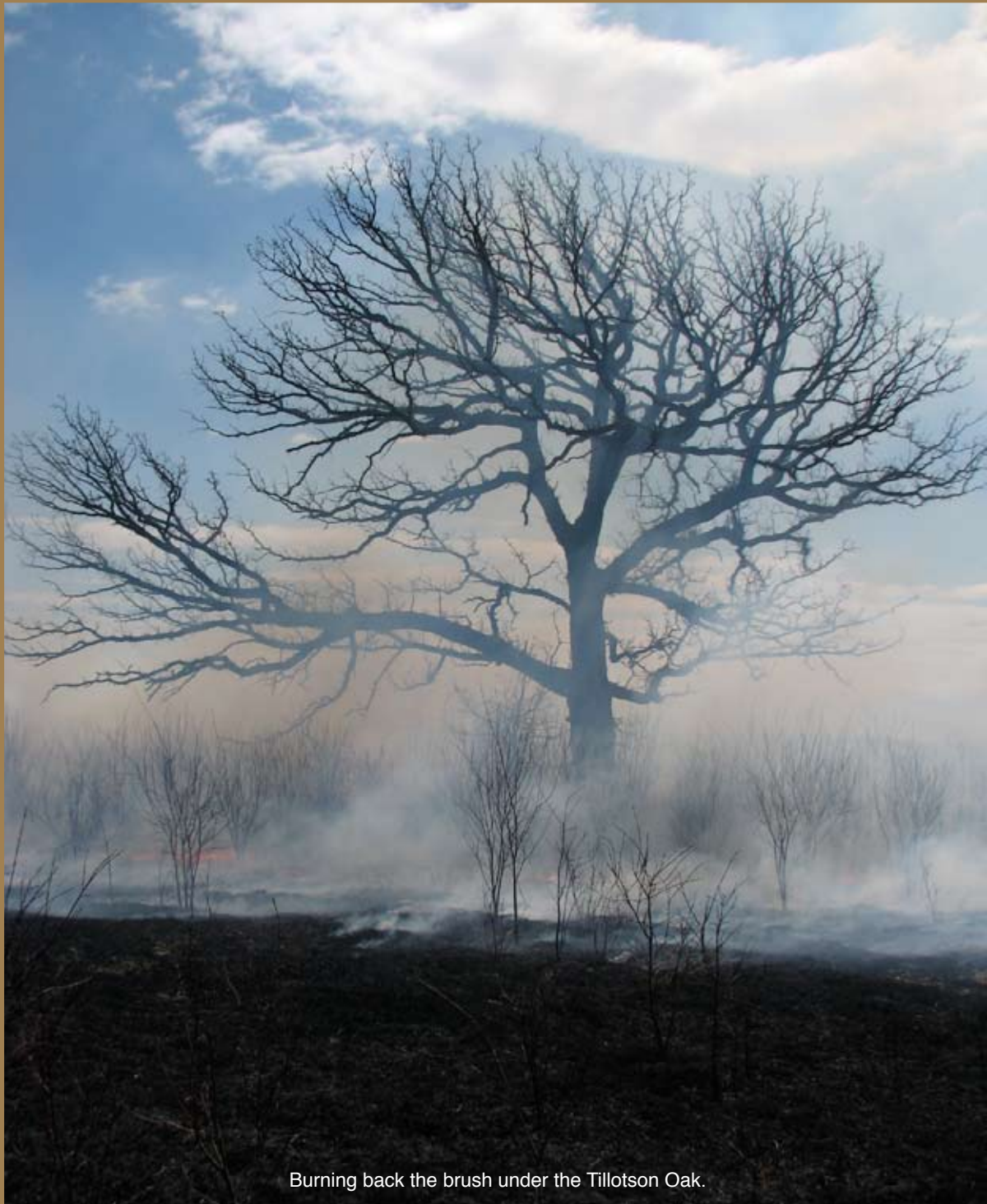
Burning back the brush under the Tillotson Oak.