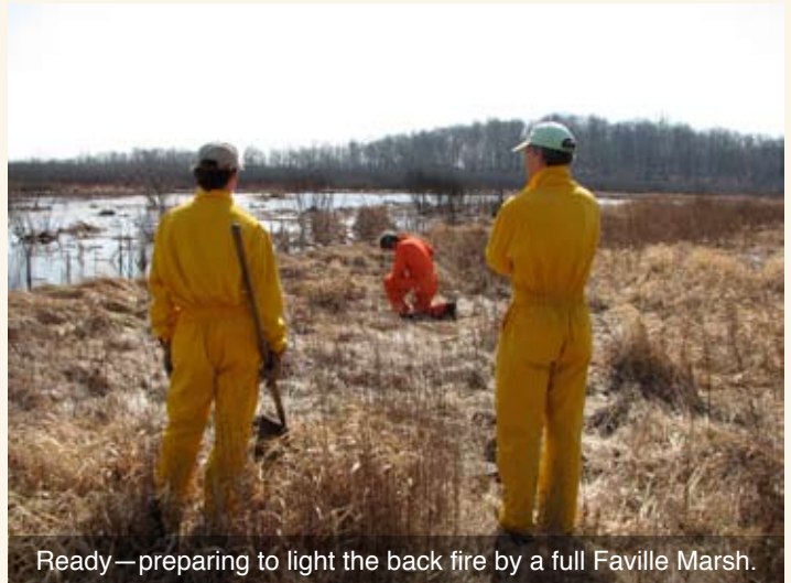
Ready—preparing to light the back fire by a full Faville Marsh.

There's nothing like a good burn to quicken the pulse, but when you get a call at work from a neighbor saying that the fire department is fighting a grass fire near your house, it's a bit much. Actually, four fire departments, as it turned out. It is not known how the fire started along Woodland Road , but with a south wind and very low humidity, it eventually burned all the way to Highway 89, from North Shore Road on the west, well into Faville Woods on the east, covering about 60 acres in all. The fire burned within about