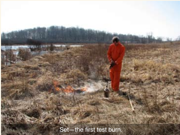
Set—the first test burn.

sanctuary. Many days this spring with extremely low humidity made for some very effective burns, even where fuel was sparse in newer seedings or as a result of last summer's flooding. A good burn on Tillotson and Martin prairies top-killed the invading brush except in the wettest areas. With things greening up quickly, we wrapped up the season last Sunday with a burn that we hope killed an infestation of sweet clover in an un-restored area of the sanctuary.