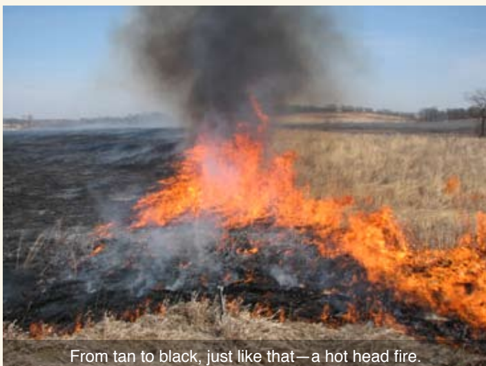
From tan to black, just like that—a hot head fire.

We actually began burning last fall before our November planting when we burned the entire 80-acre Charles Prairie (we planted the south 40). Later in November, we burned 40 acres of the Lower Brandt