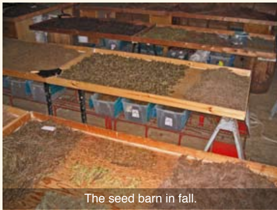
The seed barn in fall.

Regular seed collecting at Faville Grove Sanctuary begins Saturday, September 5 and continues every Saturday from 9:30 a.m. until noon and 1:30 p.m. to 4:00 p.m., as well as every Wednesday from 9:30 a.m. to noon through October. We will meet at the sanctuary sign on Prairie Lane (click for a map) and travel from there a short distance to our collecting spot for the day. We will post work locations for anyone who arrives late. Bring gloves, sunscreen and insect repellent, and hand clippers if you have them.