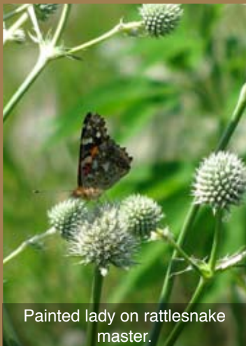
Painted lady on rattlesnake master.

To make the sanctuary even more visitor friendly, Bob Marshall of Middleton volunteered to prepare this map. Great job, Bob! We plan to include the map in a sanctuary brochure to be developed, and will post it in a new kiosk that is being built for installation on upper Prairie Lane.