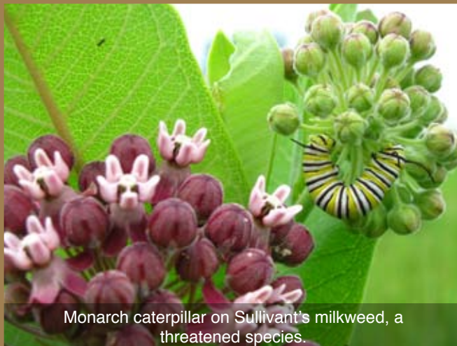
Monarch caterpillar on Sullivant's milkweed, a threatened species.